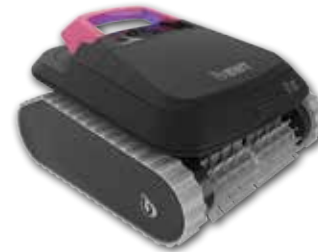
Robotic pool cleaner