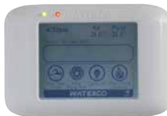
Aquamaster pool automation controller