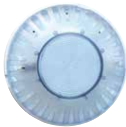
Britestream LED lights

Zane Gulfpanels are precision injection-moulded from a high-grade formulated polymer, which was selected for its outstanding heat transfer properties and its exceptional durability