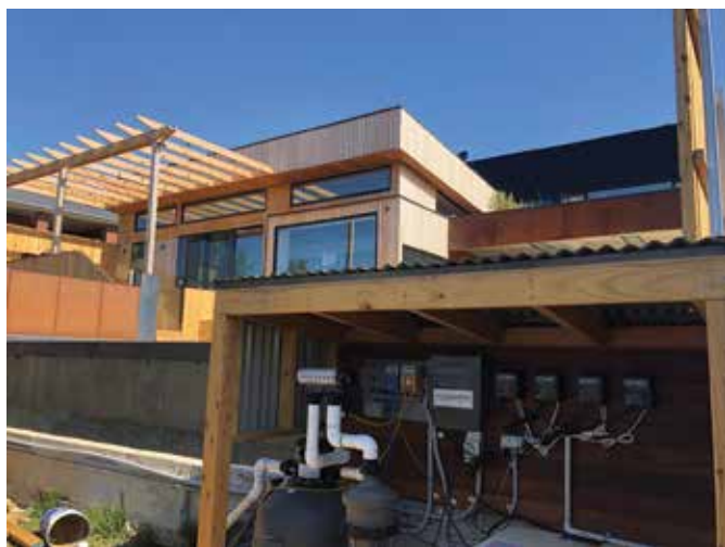
Waterco's products address all the low energy requirements and reduction in water wastage.

"We required products that treated the water without increasing the need for backwashing or topping up," he explains. "The goal was to install a superior sanitisation system that could be utilised back onto the site rather than flushed into the sewer system."