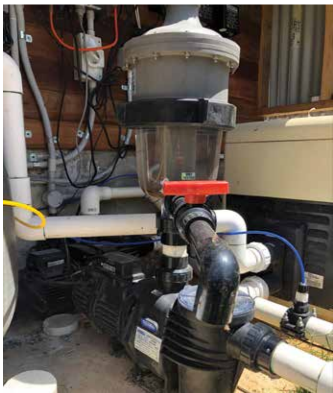
The MultiCyclone unit also only disperses 15 litres of water when flushing its cleaning cycle.

"All of this ensured the filtration system ticked every box from a sustainability point of view and made the entire system extremely efficient," he says.