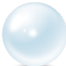
Glass Pearl filter media