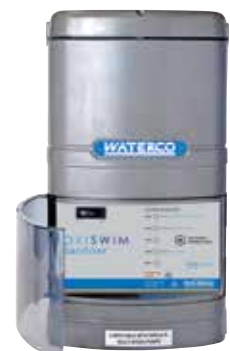
Oxi Swim Dual Sanitisation System