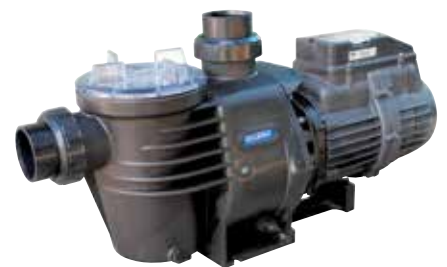
Hydrostorm ECO-V pump