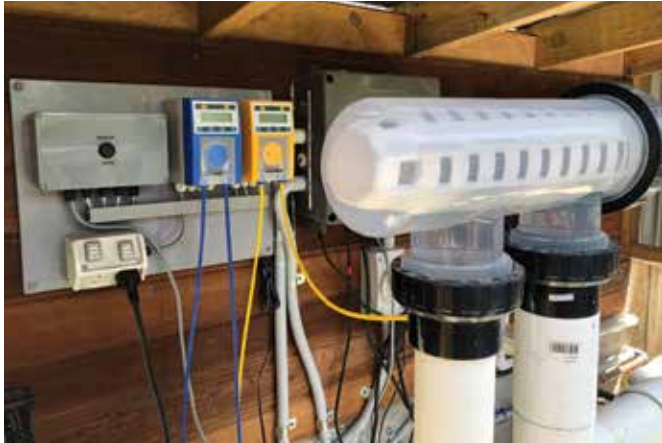
The Oxi Swim Sanitiser Cell combines the use of electrolysis with hydrogen peroxide to form a bacterial killing weapon.