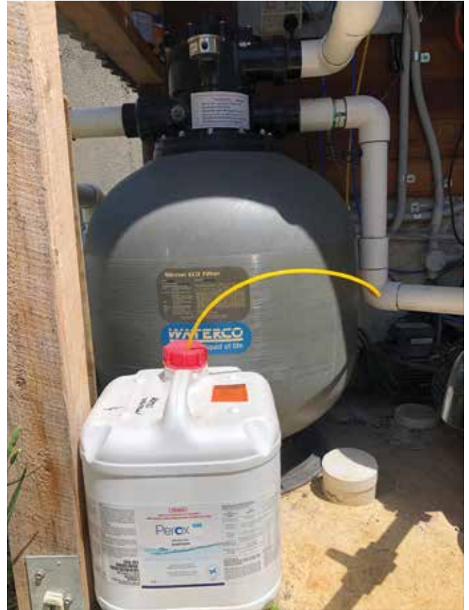
Water and oxygen are necessary elements for the existence of human life. Therefore, it seems only natural to use hydrogen peroxide to keep your swimming pool and spa naturally clean.

A revolutionary breakthrough in water treatment technology, the Oxi Swim Sanitiser Cell combines the use of electrolysis with hydrogen peroxide to form a bacterial killing weapon. The combined power of two sanitisers provides an oxygen rich swimming environment that is extremely efficient in neutralising pathogens. It's a dual system, which means you can flip the system in winter to a low salt chlorinated pool.